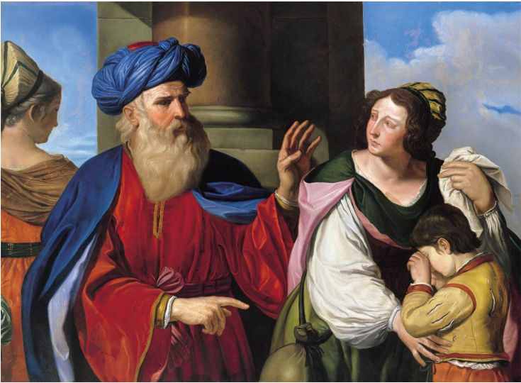
Abramo ripudia Agar e Ismaele by Guercino in 1657. Source . More info on artist .

One of the best explanations in the Bible of who are the “Jews” and the children of Abraham is in Paul’s letter to the believers in Galatia in the First Century. Galatia was a province in the Roman Empire at the time, in what is today central Turkey.